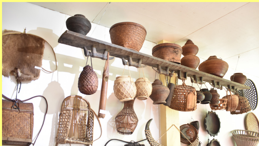
Cultural Heritage https://bit.ly/3kl3swA