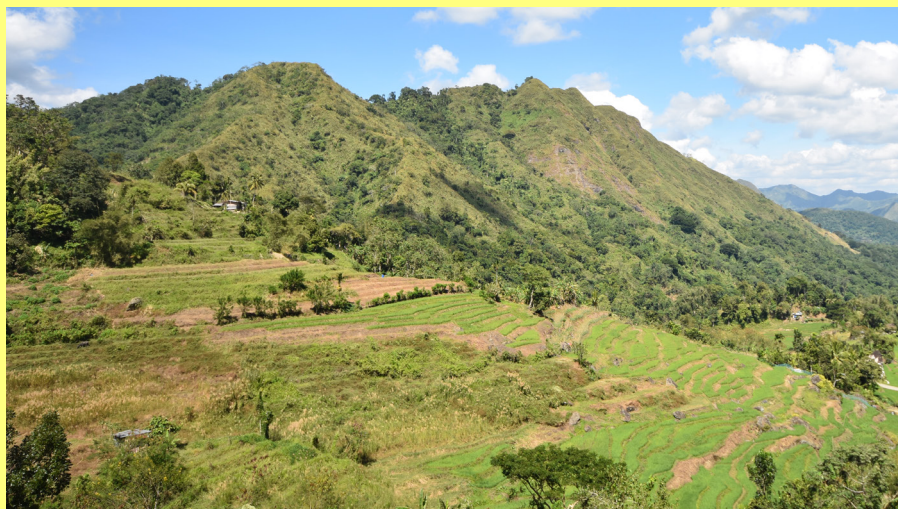
Natural Heritage https://bit.ly/32XUEwn