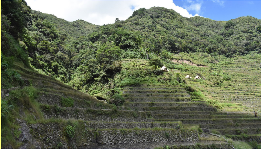
Ifugao Rice Terrace Construction https://bit.ly/34sJK3i

On inila yu an nan punliyak/punhabal di Immipuggo ya nibilang an organic farming? Nu uggem inila handi, aduwani inilam yu mo? Dan adi ayu mun-amlong ta nan pangat di a-ammod handi ya maphod an punnanongon di nunlinikkodan. Itultuluy yu pay kuma nan maphod an pangat hi punliyak/punhabal hinan umalin timpu.