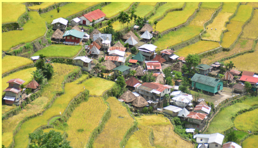
The Concept of Eco-Villages https://bit.ly/2ITEVr8

Adalon tau nan nanomnom (concept) nan eco-village. Buyaon nan video da'ul na ta innilaon nu ngadan diye.