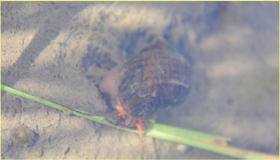
Pest Management in the Ifugao Rice Terraces https://bit.ly/3lbQfO3