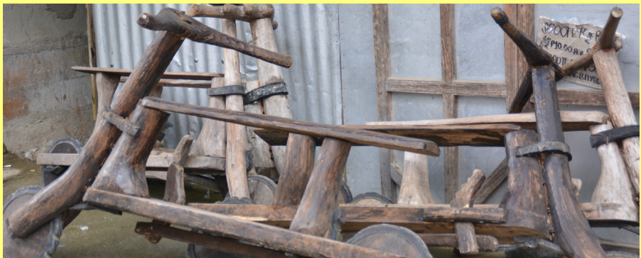
Ifugao Traditional Games https://bit.ly/36VNBWa

Tigon yu nadan video mipanggep hi ka'kaat di ay-ayam tau: