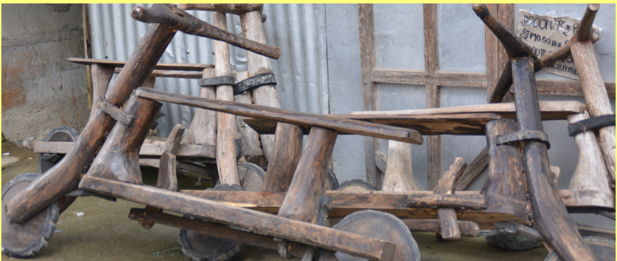
Ifugao Traditional Games https://bit.ly/36VNBWa

Tikgán dju toy án video mipanggep hi ka'a-at haná na-insiguchán án ed-edjam: