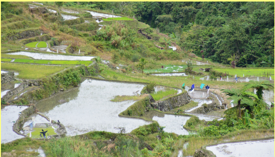
Land Preparation in the Ifugao Rice Terraces https://bit.ly/3hr7CYR