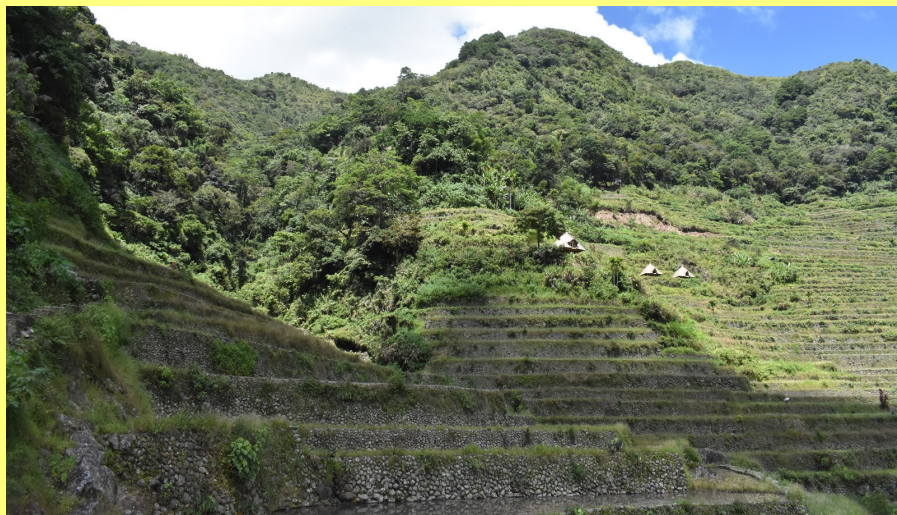
Ifugao Rice Terrace Construction https://bit.ly/34sJK3i

Inila dju ba, án hinuy punliya'/punhapfaa chah etoy nun-a kginitti án papadjaw chi Immipugkgaw djá nipfilang án organic farming? Nu agkguy dju pay inila, ad uwan djá iniláon dju moh. Ot chán áchi dju uchót idjamlong hitoy án pango'oy chi o-ommod chin nahop án mas pay mahalimunán chi nunlináwlaw djá manáynáy nuy ka-aphod ná? Unakkayni' itutuluy dju'n atón hatu án pango'oy ta gwaáy pang-unnuhán nán mehnot hi pidgwa.