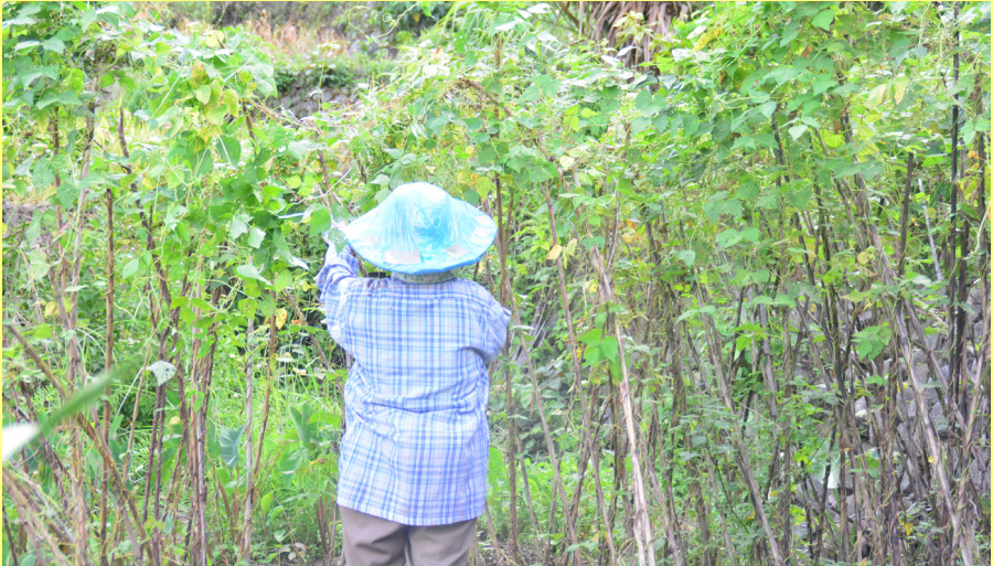
Global Missions: The Sustainable Development Goals https://bit.ly/34tloGY

Áychuy náhhun án inat dju, nunpili ádjuh tulu (3) án goals chi sustainable development án kadju páhhunon án aton. Ad uwán djá ituluy djúh. Nu ikonektar dju áychuy tulu án pinili djun mahhun án goals, ngay mattig djun akem (roles) án mápfálin wenno o-lóg djun atón ta makapfadchang inuy akgibpfuhan nuy goals án ma-át. Punhuhummanganán dju djá inamong djuh nuy kapanunutan chi ohan-oha. Nakgibfoh ádjá djá in-upload dju hi facebook group. Mápfálin án i-upload dju án lahlatuh háná intanucho' djun output dju wenno i-type dju inuy digital word processor.