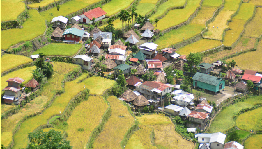
The Concept of Eco-Villages https://bit.ly/2ITEVr8

Ád uwán djá achalon ta-úh nuy umatán/buyán chi eco-village hi ayta-ú punbuyán etoy video gwáy cha'o náh ta ihnáy ma-ammán inuy nomnom dju ngay umatánh.