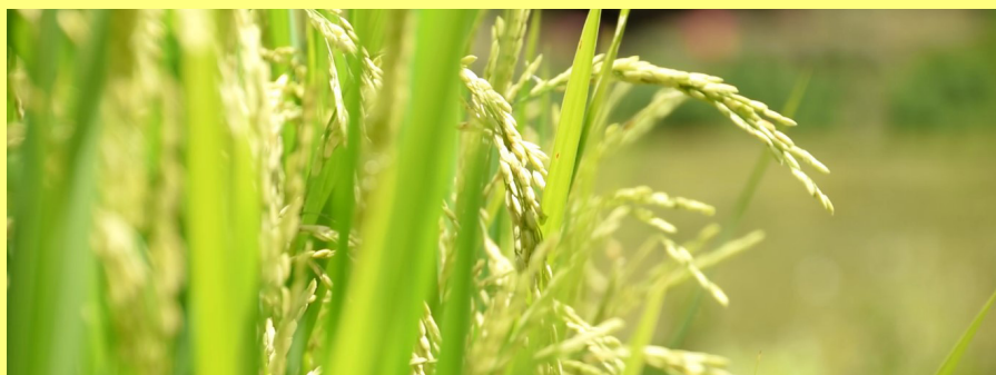
Ifugao Traditional Rice Production https://bit.ly/32h819W

Buyaón ta-ú n'án hán video án mangipattig hi pangat chi Immipugkaw án punliya'/punhapfaa nán a-apu chin nahóp (Organic Farming Methods of Ifugao). Háy uchúm áy cha'ju djá mápfálin án iníla dju moh nu engkganad uwán djá at-atton pay nán o-ommod djuh.