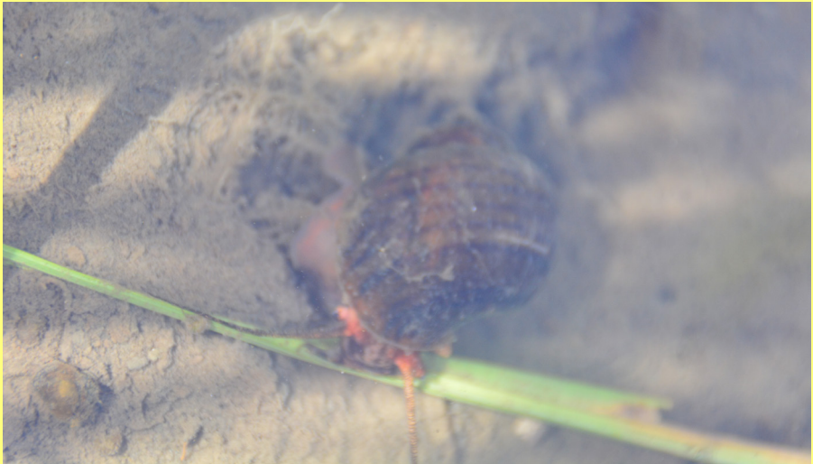
Pest Management in the Ifugao Rice Terraces https://bit.ly/3lbQfO3